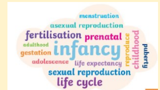
Science— Animals including humans