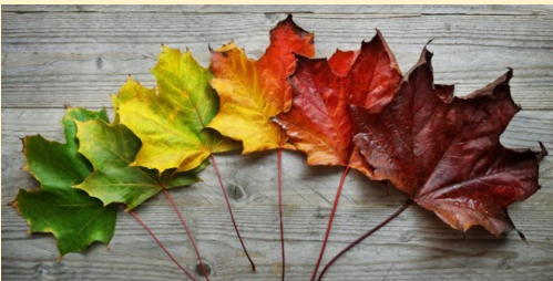
Year 5, Term 6