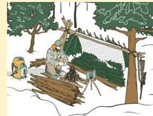
Outdoor learning—bush craft