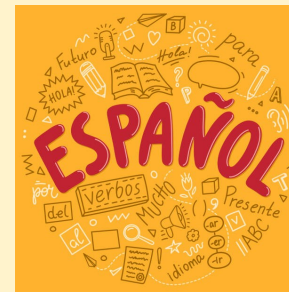
Spanish—Tell me a story