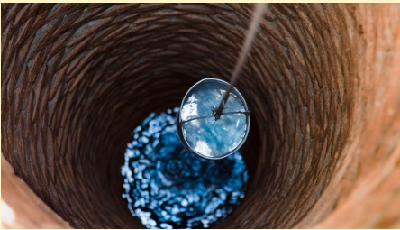
Writing—Openings and Closings and Instructions.